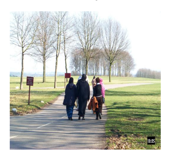
Walk in the park