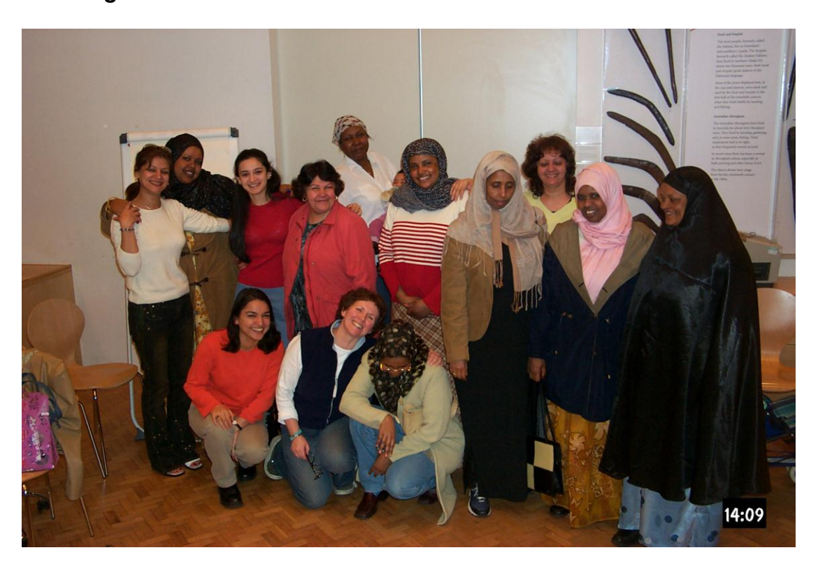
3.1.3. Intended Outcome: To widen the participation and use of Manchester's cultural and learning institutions, specifically Manchester Museum and Manchester Art Gallery.

Taking up the opportunity to visit different parts of the Art Gallery and the Museum and to see what the institutions can offer to communities created first hand experience and appreciation of the different artefacts available. Seeing things from their own countries inspired a sense of belonging within the women. They mentioned their enjoyment and appreciation of seeing and learning things that they would not have seen or learned otherwise. They also commented on the staff: by explaining and reading the information about displays for the women, the staff were perceived to be very supportive.